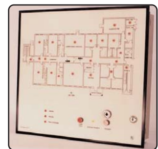
Below - Commercial Building Security System Graphic Display printed from Architectural Drawing

OPERATION: Flair Graphic Annunciators can be manufactured as "stand alone" annunciators or as remote (slave) displays for any other control panel. Architectural drawings, photos or any other digital media can be used to make any size graphic. They are printed on UV resistant vinyl and laminated between several layers of protective polycarbonate sheet that will not scratch or cut during years of normal use. Each zone has a green LED for status, a red LED for alarm memory, a yellow LED for shunt and a zone control button for acknowledge, reset and bypass functions. Colored LEDs are also placed in designated areas of graphic for zone status notification. Zone and common input and output type, timers and other features are programmable with easy to use free software. Graphics can be completely customized by incorporating buttons, switches, keypads, piezos, intercoms or any other electronics.