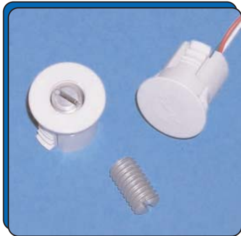
Recessed BMS Switches

PRINCIPAL OF OPERATION - Each Switch Case contains one reed switch of different magnetic sensitivity to the others. This is the magnetic tamper. When the door is closed and the Magnet is in the Balanced Position, two reed switches close and the magnetic tamper reed switch stays open. If an external magnet is placed next to the Switch in an effort to bypass the Magnetic Contact, the magnetic tamper will close causing an alarm.